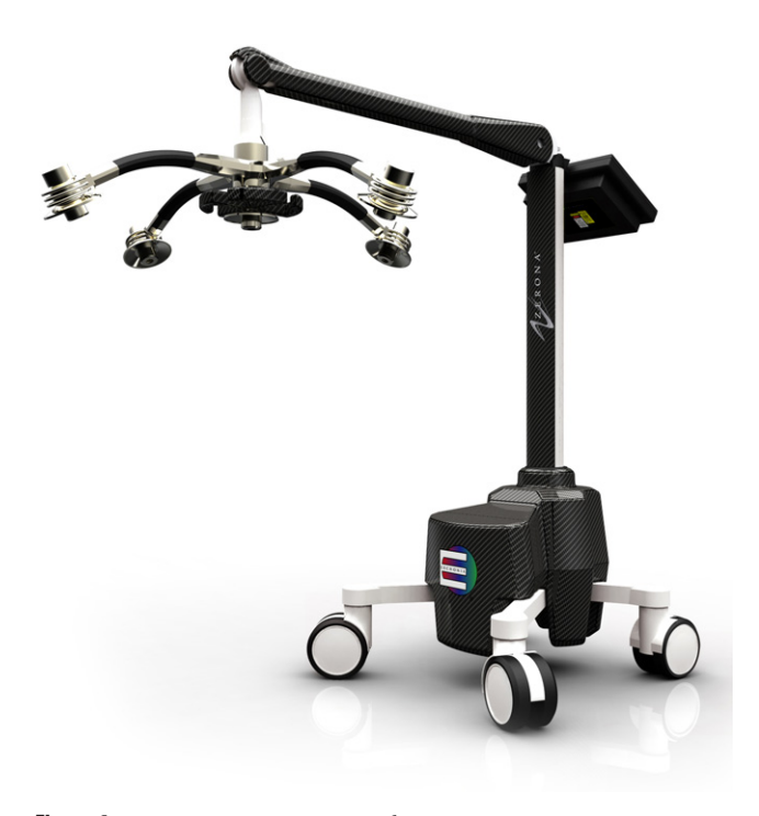
Figure 1 Zerona 635 nm LLLT Body Device.

Caruso-Davis et al<sup>35</sup> conducted a study to examine the clinical effectiveness by which 635-680-nm LLLT acts as a noninvasive body contouring intervention method. Results showed a statistically significant cumulative girth loss of -2.15 cm after eight 30-minute treatments over 4 weeks (P < .05). As a secondary objective, in vitro assays were conducted to determine cell lysis and glycerol and triglyceride release. Three separate experiments were performed to evaluate whether fat loss was induced by irradiation with LLLT due to: (1) laser activation of the complement cascade, (2) laser-induced adipocyte death, or (3) laser-induced increased triglyceride release or lipolysis from adipocytes. Obtained from subcutaneous fat during abdominal surgery, human adipose-derived stem cells were plated and differentiated to form adipocytes. In the first experiment, results showed that serum complement lysed fat cells in both irradiated and nonirradiated adipocytes. Consequently, it was determined that LLLT does not activate the complement cascade to induce fat loss from adipocytes. In the second experiment,