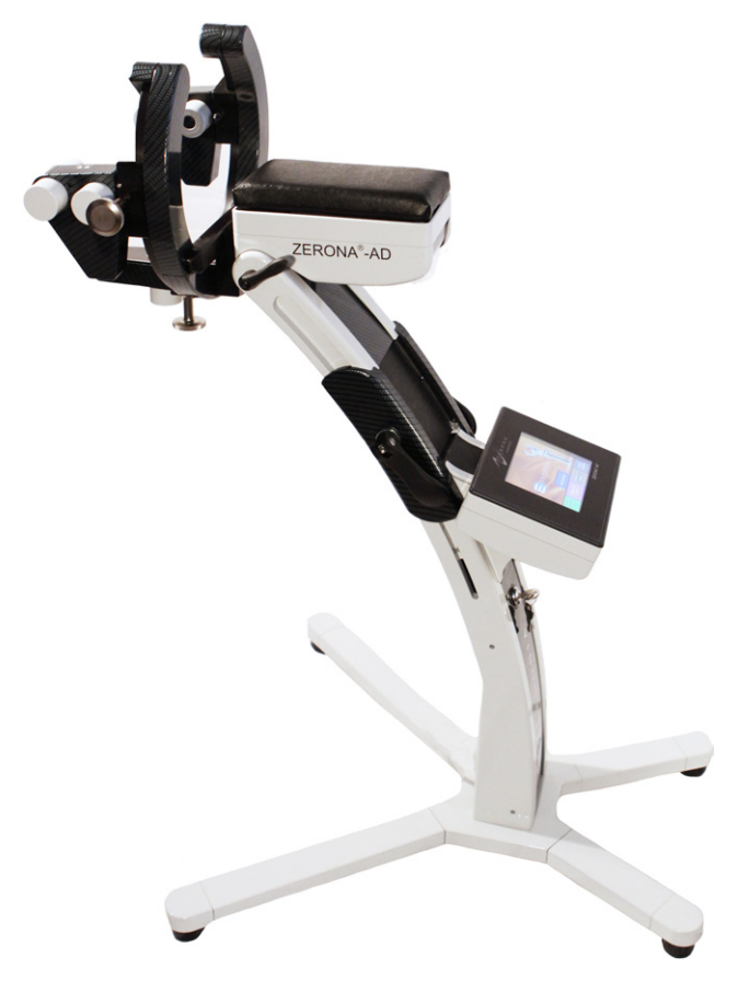
Figure 3 Zerona 635 nm LLLT Arm Device.

To fully evaluate the clinical efficacy of LLLT in a clinical model without significant confounding variables, Nestor et al<sup>39</sup> used an upper arm circumference model, and conducted a randomized double-blind study (n = 40) in which patients received either three 20-minute LLLT (635-nm Zerona AD, Erchonia Corporation, McKinney, TX) (Fig. 3) or sham treatments each week for 2 weeks. The primary outcome measures were the number of subjects who achieved a total decrease in arm circumference \geq 1.25 cm for the 3 combined measurement points after 2 weeks of 3 treatments a week for a total of 6 treatments, as well as the average difference between the combined arm circumference measurements for the active versus sham treatment groups. Their results demonstrated that after 6 total treatments in 2 weeks, 12 subjects (60%) achieved a \geq 1.5-cm decrease in upper arm circumference versus 0(0%) in the sham treatment group, and showed a combined statistically significant reduction in arm circumference of -3.7 cm (P < .0001) versus -0.2 cm. After the first week of treatment, which included 3 laser procedures, a 2.2-cm reduction in total circumference was observed, followed by a 3.7-cm reduction after the second week of 3 laser